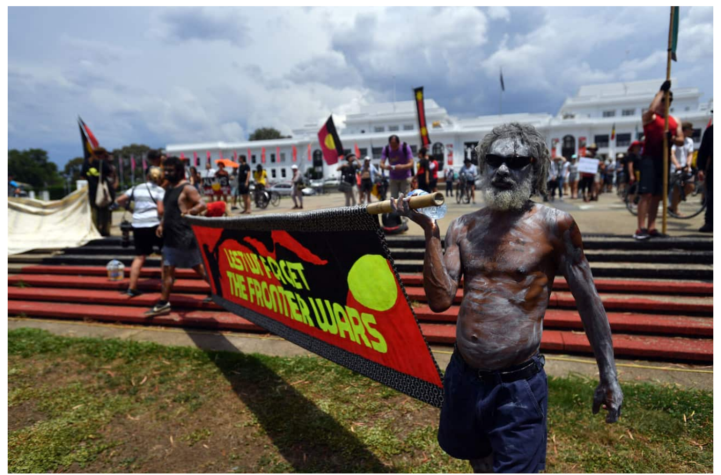
For years, calls have been made to properly memorialise those who died during the frontier wars.

As the British began to colonise New South Wales, and with no treaty in place with First Nations people, Sydney became the first battleground.