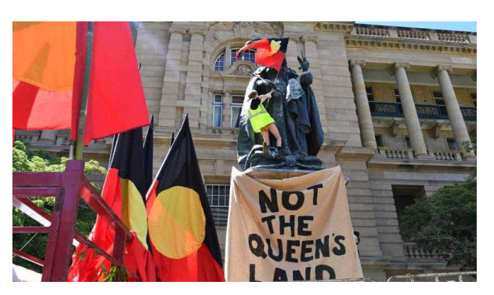
'Abolish the Monarchy' protests to oppose National Day of Mourning for Queen Elizabeth POLITICS