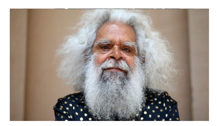
Why Uncle Jack Charles will always be a national treasure ENTERTAINMENT