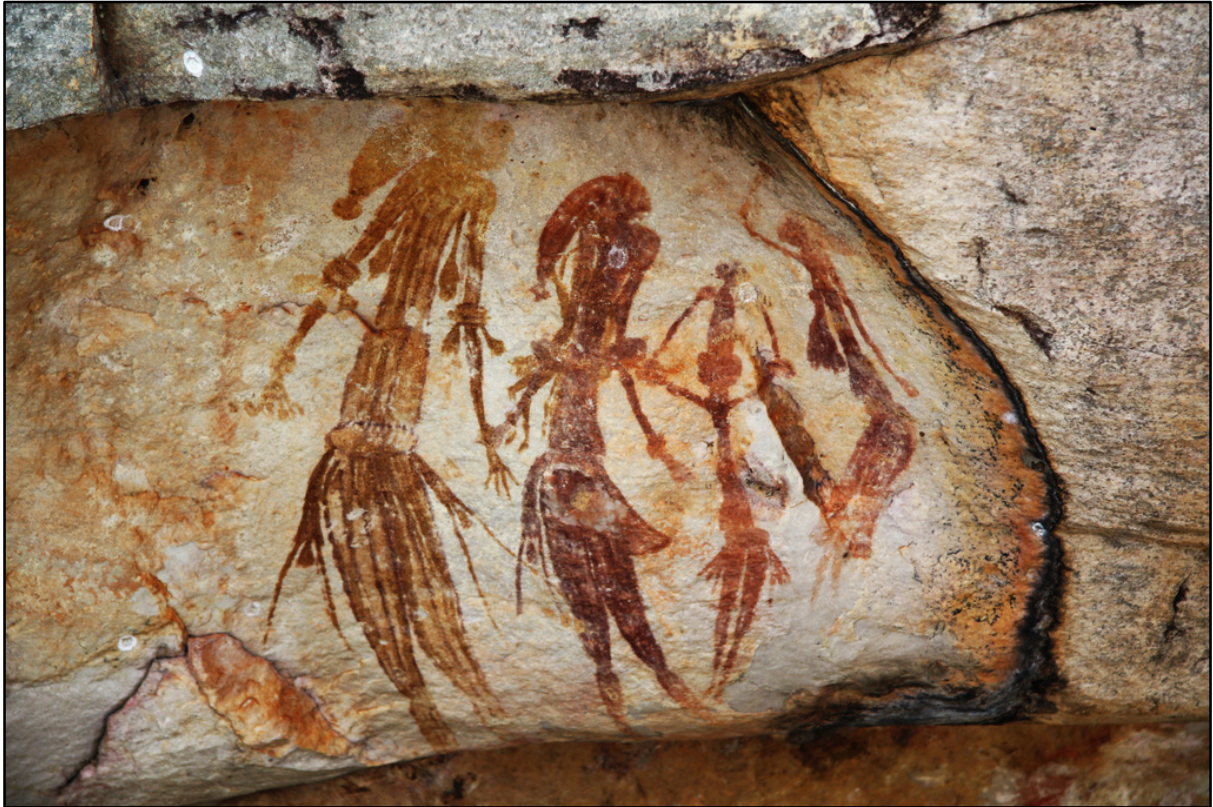
Bradshaw rock paintings help Aboriginal people record knowledge to memory.