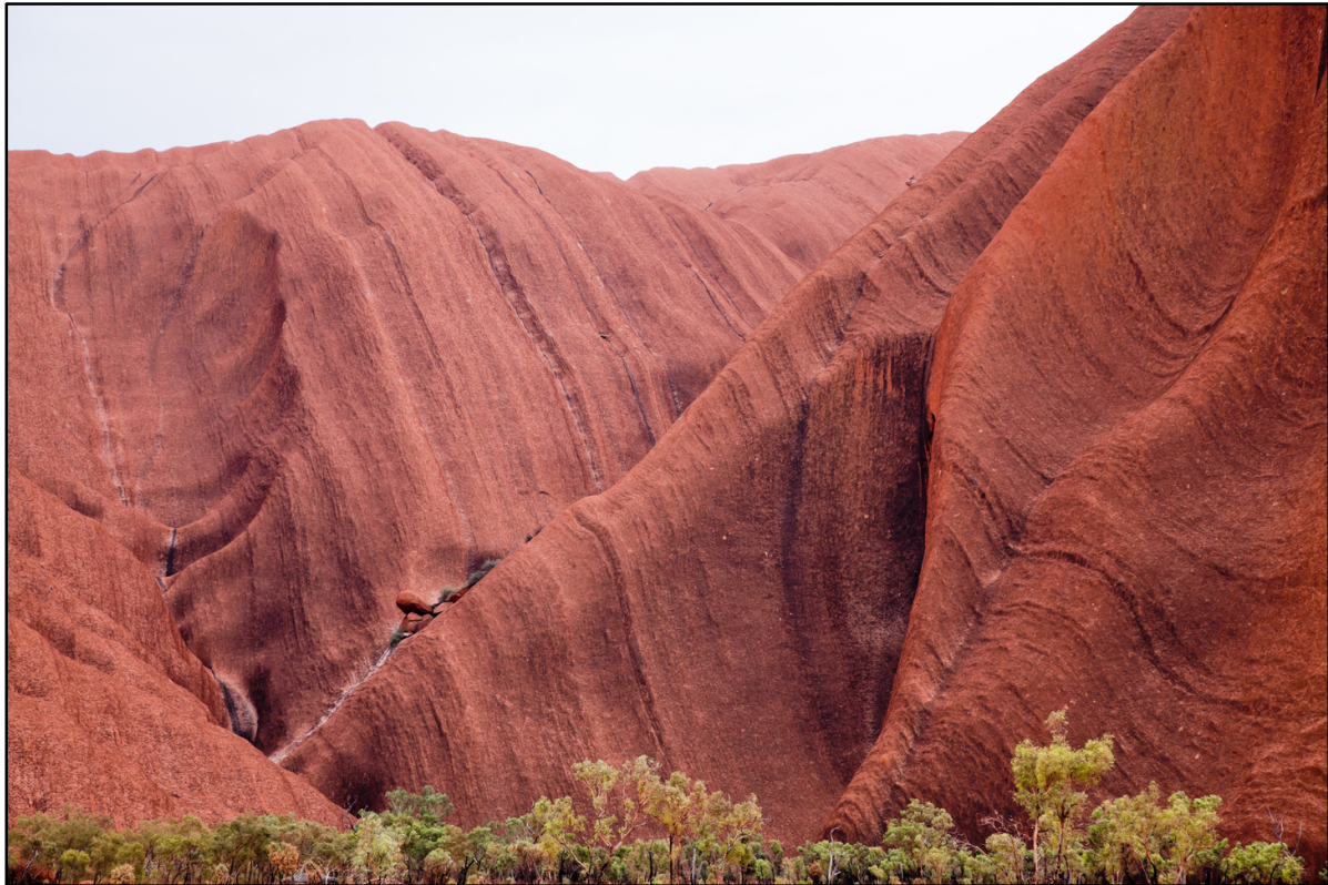
Uluru close up reveals a very textured environment.

These sites include features that are unique in shape and form. At Uluru, the Anangu elders associate every crevice, bump, and notch around the perimeter of the monolith with knowledge that is stored to memory.